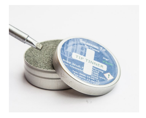
Products pictured may differ from the product delivered

Small emissions of smoke are inherent to the process. As for any hand soldering operation, an air extraction is advised.