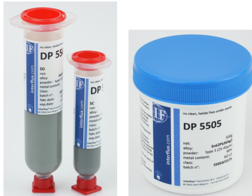
Products pictured may differ from the product delivered

DP 5505 SnPb(Ag) is classified as RO L0 according IPC and EN standards.