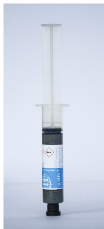
Products pictured may differ from the product delivered

The paste is classified as RO/L0 according to IPC and EN standards.